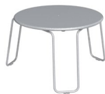
LOUNGE TABLE 16" HEIGHT / 24" DIAMETER