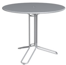
CAFÉ TABLE 30" HEIGHT / 36" DIAMETER