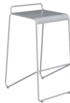
BAR HEIGHT STOOL 32.5" HEIGHT