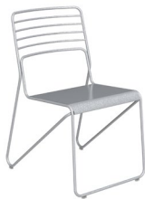
CHAIR 18" SEAT HEIGHT