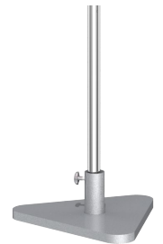
UMBRELLA BASE 50 LB WEIGHTED PLATE