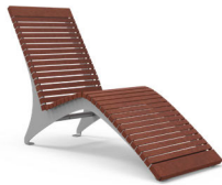
MCL720-W Ipe Wood